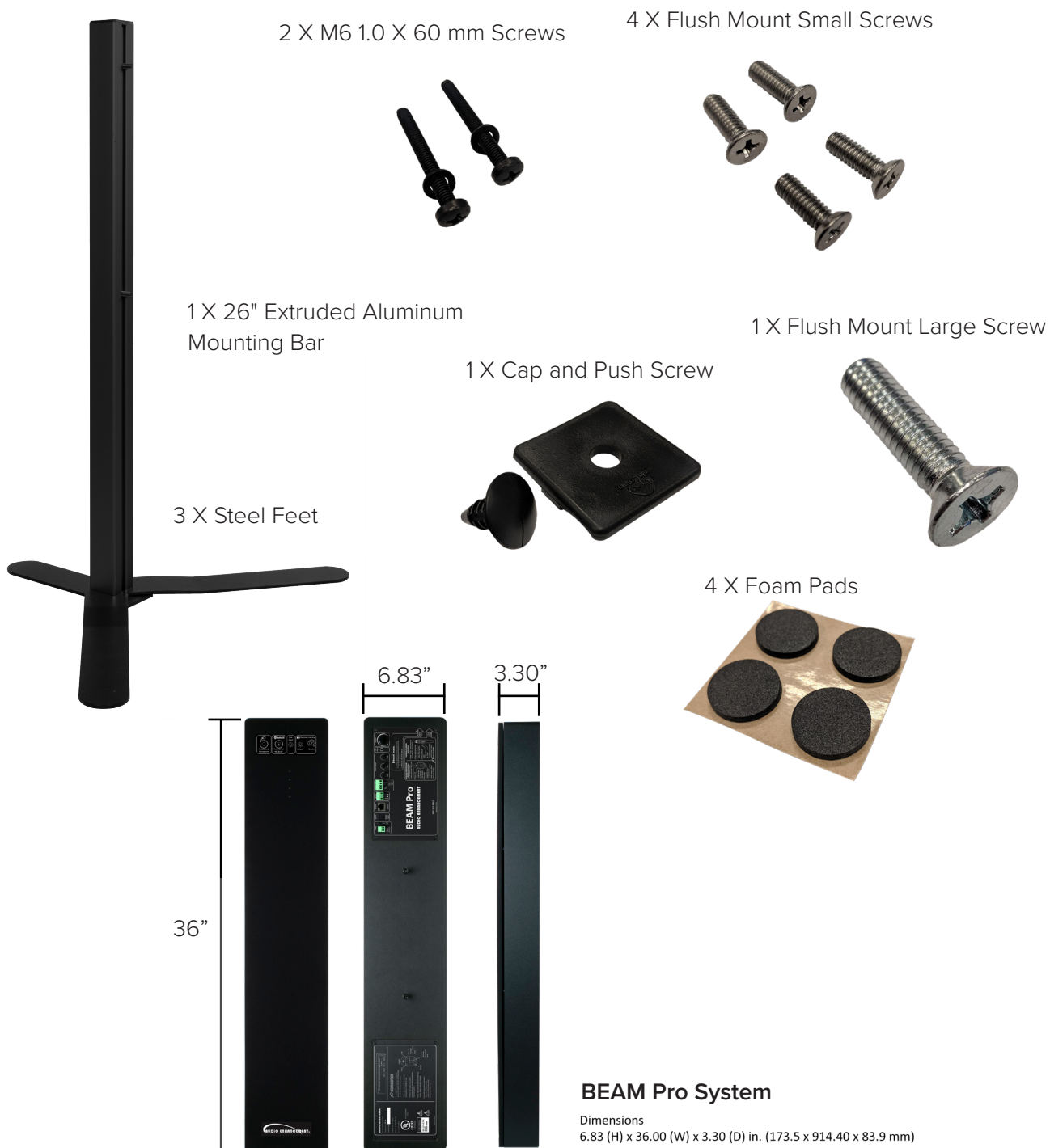
Table Top Mount Includes*: